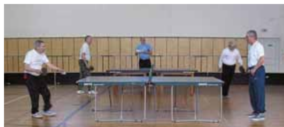
Sport day in Předměřice

An important part of the programme of the Parkinson's Society are lectures, discussions, sports competitions, visits to castles and palaces and organizing of concerts. These are realized abreast the individual branches. GSK company contributed 40 000,- CZK to support these activities.